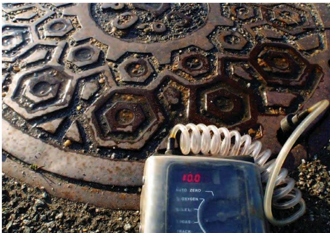
ABOVE: An accident waiting to happen: Methane at 10% (100,000 ppm) gas concentration —well above the lower explosive limit of 5% —was measured in a telecommunications manhole in Washington, D.C. Driving every street in the District, researchers found 5,893 natural gas leaks from the city’s aging pipe system. BELOW: Concentrations of methane from leaks measured in Boston.

Since the Al-Qaeda attacks of September 11, 2001, the U.S. Congressional Research Service (CRS) has been concerned about the possibility of terrorism against energy pipelines on U.S. soil. But terrorists wouldn’t need IEDs or a hijacked aircraft to trigger an explosion or spill. Over the years, like all computer technology, SCADA systems have evolved toward