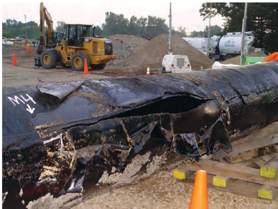
ABOVE: When 30-inch transmission pipeline Line 6B owned and operated by Enbridge Energy ruptured along a welded seam on July 25, 2010, near Marshall, MI, it released between 843,000 and 1.1 million gallons of dilbit (diluted bitumen, a type of oil sands heavy crude) into Talmadge Creek and the Kalamazoo River. It was the largest onshore oil spill in the United States. BELOW: View of part of an oil pipeline SCADA control room.

Before a new pipeline starts carrying hazardous fluids, it undergoes hydrostatic testing: it is filled with water at pressures 10% to 25% higher than the maximum operating pressure for a good 8 hours, to verify the integrity of seams, valves, etc. 5,7 Once in operation, big transmission pipelines are periodically inspected by methods ranging from visual assessment a couple times per year (from vehicles including aircraft flying along the pipeline's route) to instrumented, torpedo-shaped "smart pigs" inside the pipeline. Carried along by the fluid itself at the speed of a human runner (2 to 4 meters per second or 5 to 9 miles per hour), every few millimeters a smart pig's sensors looks for metal loss from mechanical damage or corrosion with ultrasonic transducers and magnetic flux leakage detection. Using GPS, the smart pig's inertial navigation system notes deviations in the position or direction of the pipeline due to settling or upheaval; calipers around the pig feel whether the pipe is wrinkled or gone out of round. If a problem is detected, maintenance crews can isolate a section of pipeline with pig plugs on either side to block