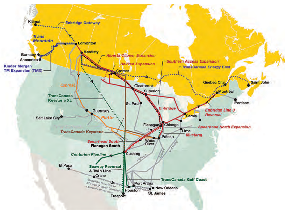
U.S. and Canadian pipelines in service and proposed. 11

for international tankers or under-sea pipelines. 10 Few have studied either dilbit's behavior in freshwater or technologies for detecting and recovering submerged or sunk-oil sands products. That is of concern because proposed pipelines carrying dilbit would pass over or under major U.S. rivers including the Missouri and Mississippi. Moreover, Enbridge is now expanding its existing Lakehead