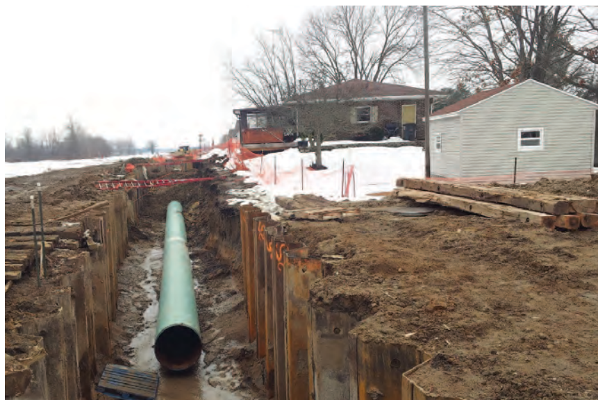
Enbridge 36-inch pipeline being installed only 7 to 15 feet from homes in Ceresco, MI, in January 2014. Replacing Line 6B that ruptured in July 2010, this new pipeline will also carry diluted bitumen (oil sands heavy crude). Made of high-strength carbon steel, its turquoise color is a fusion bond epoxy coating to resist external corrosion.

Distribution pipelines range from big to small-diameter pipe—down to 4–6 inches for distribution mains and 1 inch or smaller for service lines—that