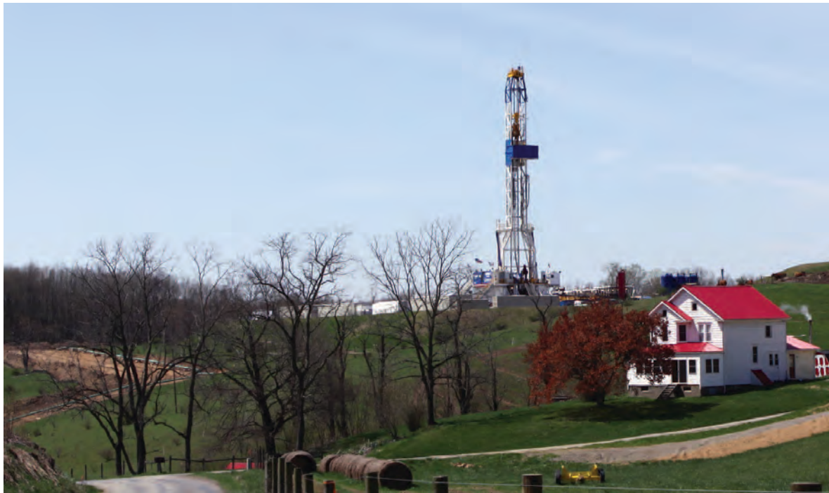
Because of the shale boom, gathering lines (under construction at the far left of the drilling rig) that will transport natural gas from the well (being drilled) pass close to individual farm homes, such as this one in eastern Ohio, photographed in April 2013. Yet 90% of rural gathering lines are not subject to federal regulations for construction and safety.

Quite apart from the whole separate question of whether the nation should charge full speed ahead toward locking in a half-century commitment to a high-carbon fossil-fuels future, it's imperative that national attention and significant resources be focused on upgrading the safety and security of existing pipelines underfoot.